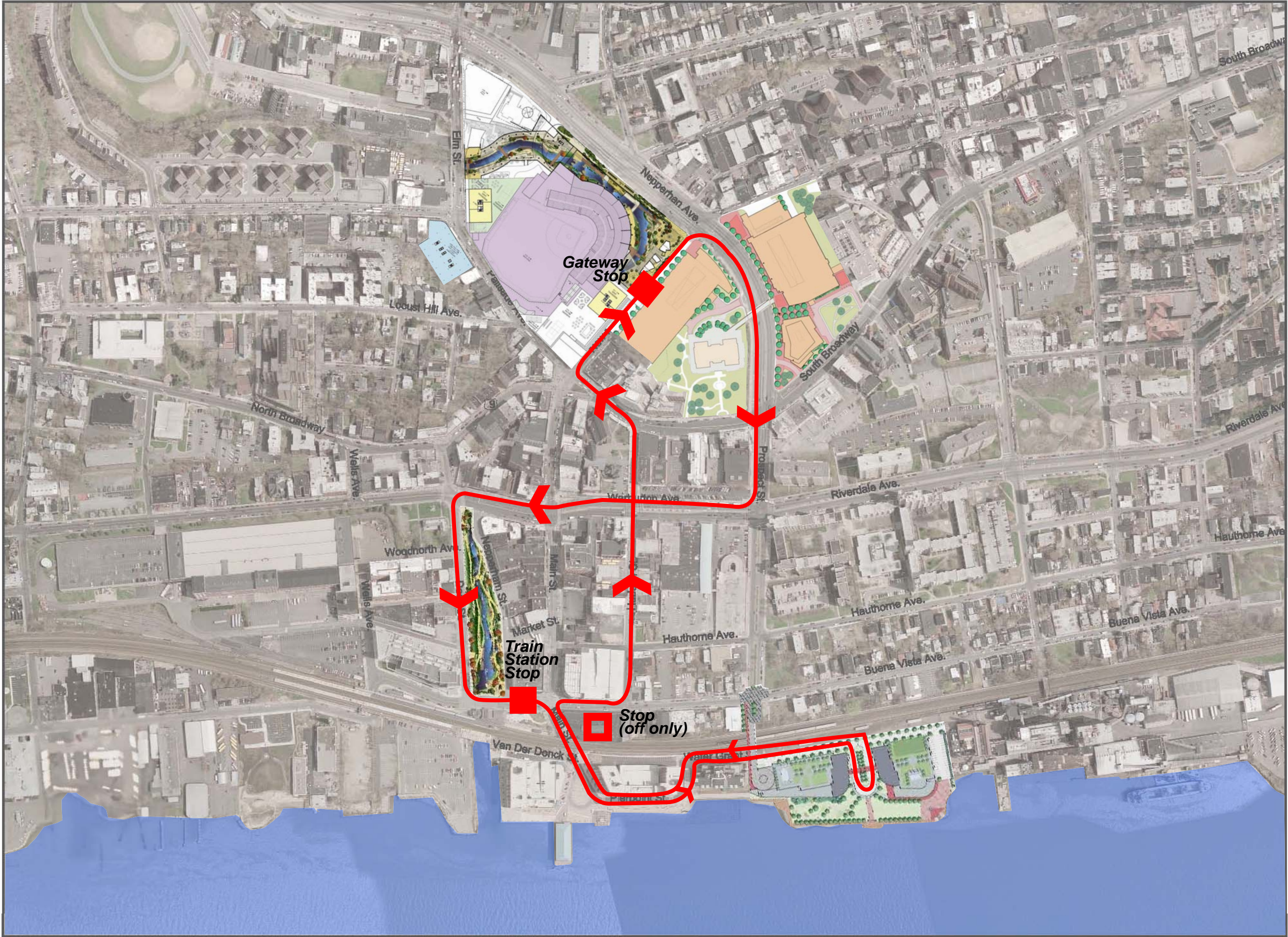
PROPOSED TROLLEY LOOP